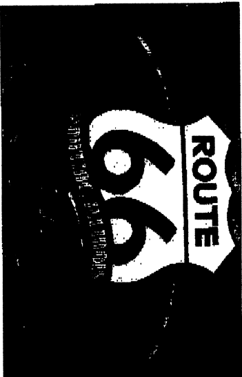
Mural- Rt. 66 Museum & Hall of Fame